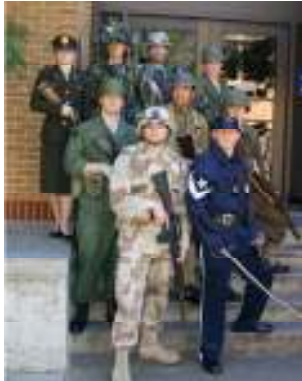
I Am A Maverick, Hall of Honor Class of 2013