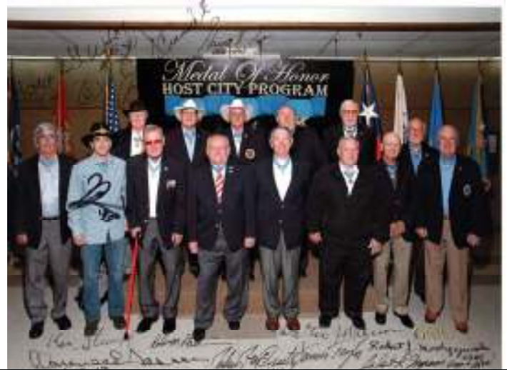
Medal of Honor recipients in Gainesville, TX, in May of 2013.

14-16 November is UTA Homecoming weekend.