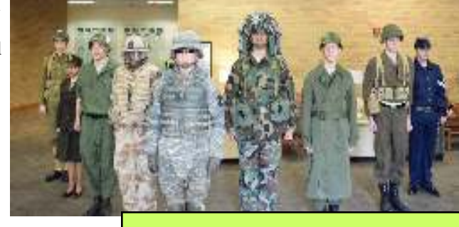
The Cadet Corps "I Am A Maverick" Team

Most alumni do not realize that a major part of the Hall of Honor is planned, put together, and conducted by the Corps of Cadets. It is one of the major learning experiences in the spring semester. The Corps staff provides a basic outline for the Hall of Honor in December. It identifies for the