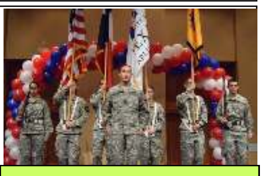
The Cadet Corps Color Guard at the Hall of Honor