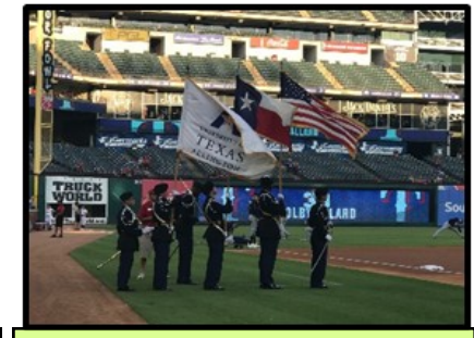
The Maverick Battalion Color Guard at a Texas Ranger game.