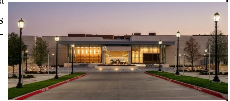
Newly remodeled E.H. Hereford University Center

We think using this year's online event to "introduce" the inductees and the following year to "gather" to honor and celebrate will provide the cadets each year with the experience of the Hall of Honor ceremony while meeting the safety guidelines required this year.